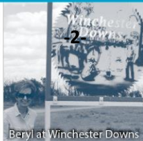
Beryl at Winchester Downs