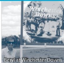
Beryl at Winchester Downs